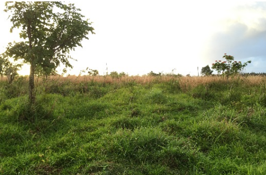
Figure 2. Photo of Haiku pasture taken while conducting vegetation inventory

This quarter was heavily focused on conservation planning due to the NRCS 2016 Farm Bill Programs sign ups. The SWCD Conservation Specialists have been assisting applicants with eligibility and planning due to the fact that Kahului's NRCS office is understaffed. My work this quarter in conservation planning has been largely focused on planning and gathering necessary eligibility documents for clients interested in applying for Farm Bill programs.