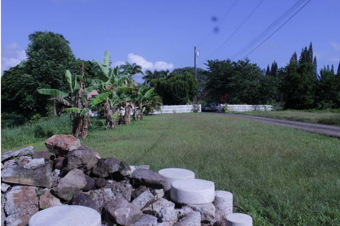
Photo 3- Some residential lots are adjacent to the future farming operations of “homestead” type cooperators