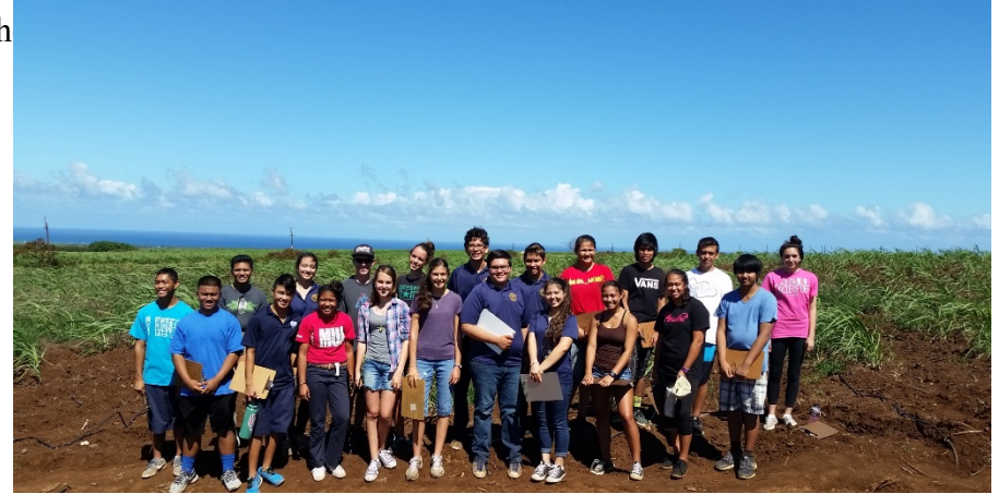
Figure 1: Participants of the 2015 CAP Land Judging Contest

It is my hopes that more high schools will utilize our assistance prior to the contest to help the students learn about the properties of soils, and understand the contest and how it works. It was apparent from the results after the contest that there were some students that did not quite understand how to correctly fill out the scoresheet. One training would have alleviated any of these issues and students would have scored higher.