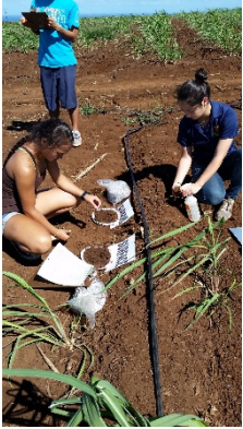
Figure 2: Students during the contest

Name, Title: JASON HEW, HACD – Maui SWCDs CS (state funded position) Ph