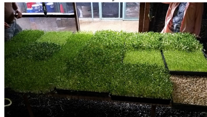
Figure 6: Micro-greens being grown at Kahanu Aina Greens in Wailuku

The first farm visit was to Vincent Mina's micro-green farm in the heart of Wailuku Town called Kahanu Aina Greens. Mina's farm is actually his backyard repurposed for micro-green production. The operation is very compact due to space limitations at approximately 2,000 square feet, but the amount of greens produced was amazing. The growing area was two screened rooms that housed the starters and the growing crops on elevated tables, with an automatic watering system. Another area contained the compost pile and worm farm that created the material for the substrate that the micro-greens were grown in. The last area was the refrigerated processing room where the micro-greens were washed, packaged, and stored in a separate refrigerator before delivery. The micro-greens that were produced at the farm included baby greens of sunflower, pea, radish, and wheatgrass, and supply hotels, restaurants, supermarkets, and health food stores on Maui and Oahu.