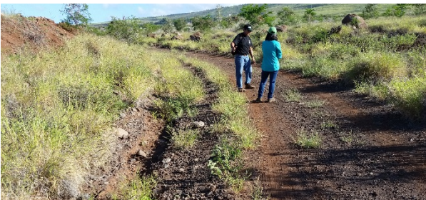
Figure 4: Wes and Kylie in a trough discussing proper design

On December 10 th , I met with Wes Nohara at the Lahainaluna Diversion for documentation and maintenance purposes. During one of Wes' annual inspections he discovered that there were dirt mounds that were built in the trough of the diversion. These dirt mounds, commonly called "whoops", are used by bicyclists as ramps for fun. These whoops were probably built by kids that have no idea about the importance of keeping the diversion clear of all obstacles. Wes wanted documentation of the obstacles and also of a portion of the berm that was damaged. After documenting the condition of the diversion, Wes and I began moving the dirt from the whoops to the damaged portion of the berm. The obstacles were removed and the berm was repaired with the available material. The work done by Wes and I was recorded and submitted to the responsible land owner.