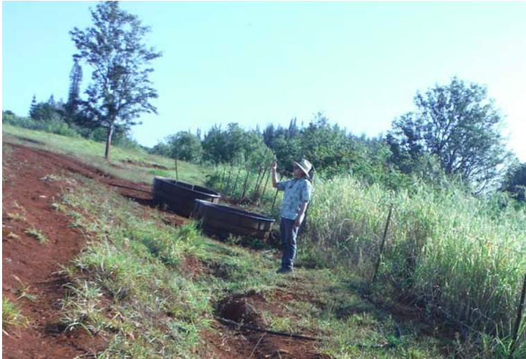
Recording a GPS point to cite the over-used trough and highly eroded pasture location. Sparse groundcover, overgrazing, and consistent animal traffic have caused gullies to form in the soil.

Upon joining the Lihue NRCS SWCD office, I was immediately able to offer my GPS and GIS skills and knowledge in the field. Despite not having computer access, I filled a niche that was previously not occupied by a designated employee. My experience with Garmin technology and photography documentation in the context of archaeology helped me take on those cooperative responsibilities during SWCD or NRCS site visits.