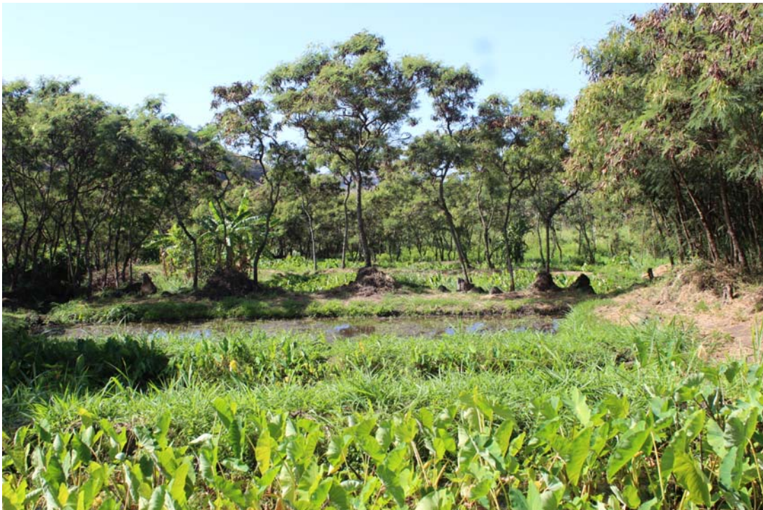
Photo 2- Restored historic loi.