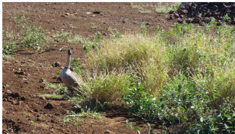
Figure 9: Male Nene goose protecting the nesting female

As discussed in previous quarterly reports, there is a cooperator in the Launiupoko area that is drastically behind schedule according to the conservation plan. Since the April 27 th , 2015 site visit, three structures have begun construction on site. One structure is the main dwelling, another is a second dwelling, and another is a detached garage. There has also been very little done in terms of completing the conservation plan, one of the two vegetative barriers were installed since April 27 th . This leaves me to believe that the cooperators priority is focused on the house construction rather than the conservation plan. The West Maui SWCD board wrote a letter to the cooperator informing them that the Vegetative Barrier and Herbaceous Wind Barrier practices must be implemented by the end of December, 2015 in order for the conservation plan to not be canceled. This is a concern for the cooperator because of the circumstances that the conservation plan was developed. The cooperator cleared the entire 15 acre property