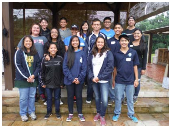
All three state teams come together to pose for a picture to commemorate another year of the Conservation Awareness Contest in Hawaii.

(and then immediately tabled in the same breath) at the most recent HACD quarterly meeting, I have taken this as a sign of optimism in terms of the general consensus that this contest is outdated for the likes of today's high school students. Some changes need to be made at the state level if our Conservation District-sponsored competition is going to remain relevant and interesting enough to attract teacher and student participation.