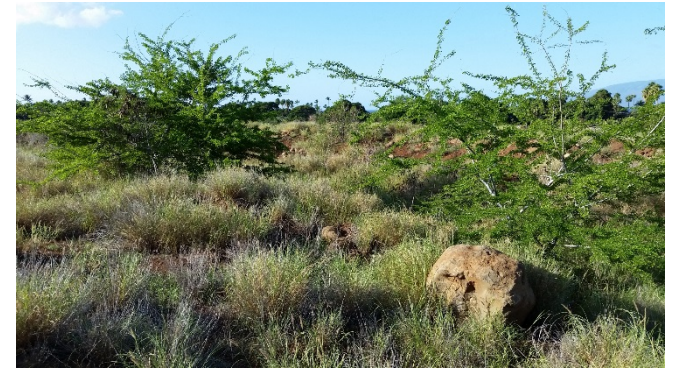
Figure 4: Buffel grass and Opiuma trees in trough

The Conservation Specialists also joined Wes Nohara for the Lahaina Temporary Flood Control annual inspection. This inspection was especially important because it was Wes' last, so we will now be conducting the inspection. It was important to learn what maintenance needs to be done, and how structural integrity of the berms, troughs, and drainage ways can be improved. Grubbing of vegetation in diversion troughs, and repairing berms damaged from human activities were the main concerns. We also went to inspect access roads on the Kamehameha Schools Kuia lands, as there were reports of erosion issues. These access roads were put in by the State for fire protection, but were completed in a manner that did not account for drainage and erosion. The roads were cut straight up and down, and have neglected the use of existing diversions to drain water into the gulches. There were large rills along the sides of the road, and many exposed rocks where soil had eroded away. Fixing these roads will be very expensive, but a collaborative effort between landowners and stakeholders will hopefully allow these concerns to be addressed.