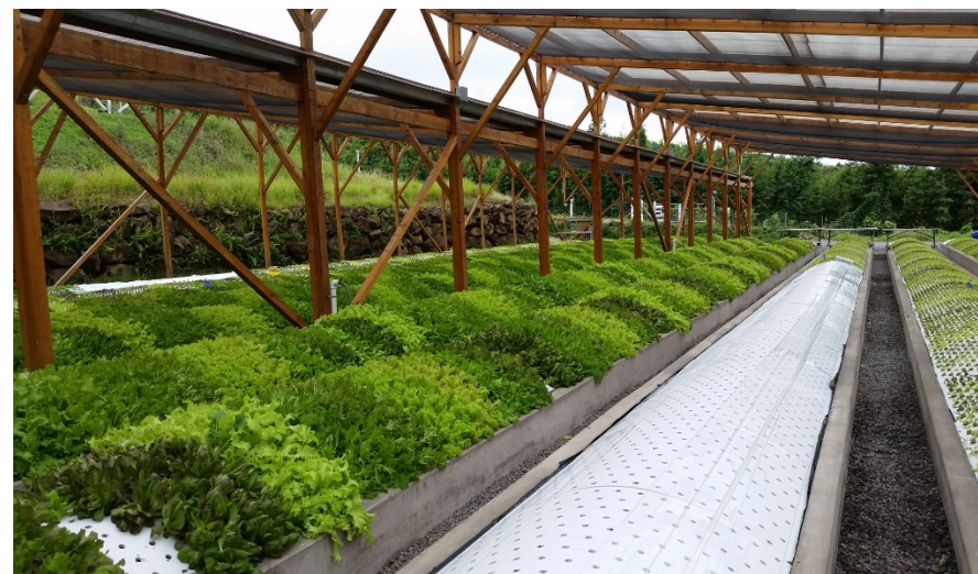
Figure 8: Kula Makai Farm setup

After a lunch at the Ulupalakua Ranch Store, we continued to our last farm visit at the Kula Makai Farm. The Kula Makai Farm is an aeroponic farm that grows a variety greens. This is the first aeroponic farm or operation that I have seen. The operation is like hydroponics except that the roots of the plants do not sit in water, they are suspended in air and the nutrient rich water is sprayed constantly on the roots. The water is then recaptured and recycled into the system. The "beds" that the greens grow