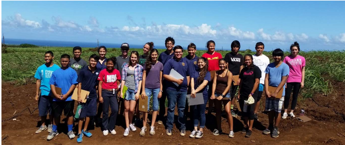
Figure 3. Student participants at the 2015 CAP Contest

There were 25 students from five schools that participated this year. The Soil Seekers, a home school student group, placed third. This was exciting as this was their first time participating in the CAP contest. Kamehameha Schools placed first, and St. Anthony second.