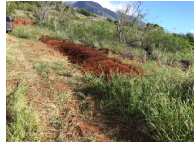
Figure 3: The reconstructed berm from the Lahainaluna Diversion

On December 16 th , Wes Nohara, Kylie Wong and I conducted the annual inspection of the Lahaina Temporary Flood Control Project. The system consists of an earthen berm and trough and a series of sediment basins. The annual inspection was conducted last year around the same time, and since then there has been no maintenance to the system. One reason for the lack of