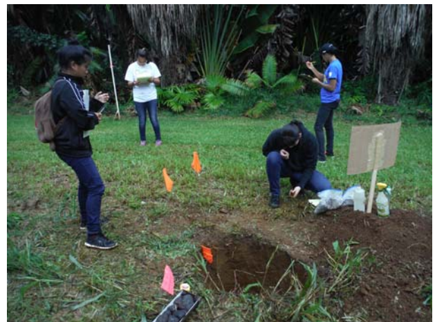
Students examine 1 of 3 sites at the 2015 annual state competition in Hilo.