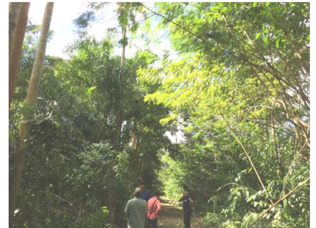
Figure 1. Photo of agroforestry system taken while conducting vegetation inventory.

The Kahului Field Office also underwent a spot check. This is when practices that have been certified and reported for goals are selected for review. The spot checker reviews both the folder for documentation and conducts a site visit to verify that the conservation practice has been implemented to standards and specifications. Kori, the acting Area Resource Conservationist, came to Maui for two days to complete the spot checks. Two of my old plans were selected, and I was required