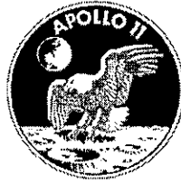
BUZZ ALDRIN Astronaut