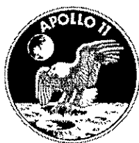
BUZZ ALDRIN Astronaut