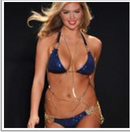
7 Smoking Hot Celebrities with REAL Bodies