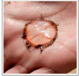
New Testosterone Booster Takes GNC By Storm