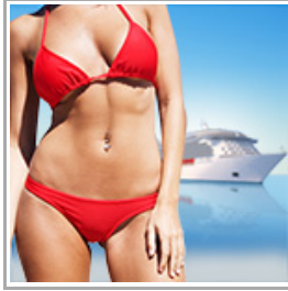
How Cruise Ships Fill Their Unsold Cabins