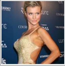
7 Hottest Stars Of 2013