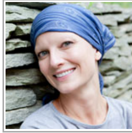
5 Warning Signs That Cancer Is Starting in Your Body