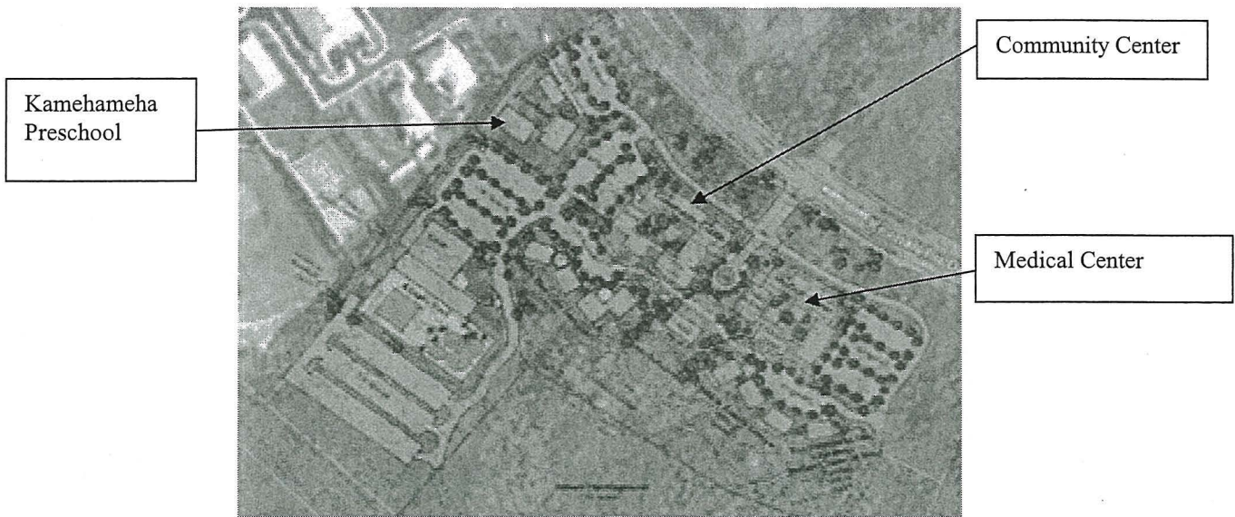
Figure 1 La'i'Opua Community Center Complex Conceptual Plan

The vision for the complex arose out of community discussions in 2005 about the lack of recreational facilities and social services close to La'i'Opua. The project was initially conceived as a community center building and sports fields. As discussions throughout the community continued, the vision for the complex grew and several organizations became interested in partnering with us. Currently, our partners include the West Hawai'i Community Health Center (WHCHC), Kealakehe High School, the Kamehameha Schools, the Office of Hawaiian Affairs, Alu Like, Legal Aid Society, Child and Family Service, Kona Adult Day Care Services, Neighborhood Place of Kona, Friends of the Children's Justice Center, and the County of Hawai'i. (See Ex. A- La'i'opua 2020 Community Center Master Plan, CCMP )