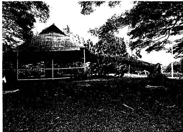
Future site after demolition of condemned building

Entrance to Hee'ia State Park 46-465 Kamehameha Hwy Kaneohe HI 96744