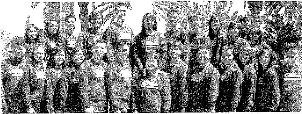
Farrington Robotics Team 2504 at VEX Robotics World Championship with the generous help of FACF – Thank You, FACF!