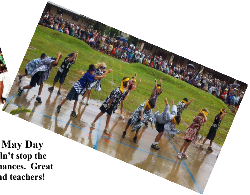
Mililani Ike May Day A rainy day didn't stop the amazing performances. Great job students and teachers!