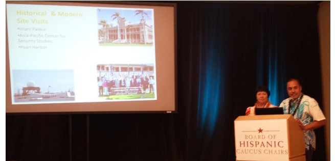
I joined Senator Dela Cruz in a presentation to preview the coming national conference of the BHCC in Hawaii.

Hispanic Heritage Month continues through October 15. A new report on a growing segment of the Hispanic population in Hawaii is available at: http://www.migrationpolicy.org/pubs/MexicansinHawaii.pdf