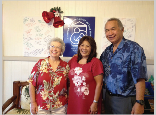
Senator Kahele at the Children's Justice Center of East Hawai'i