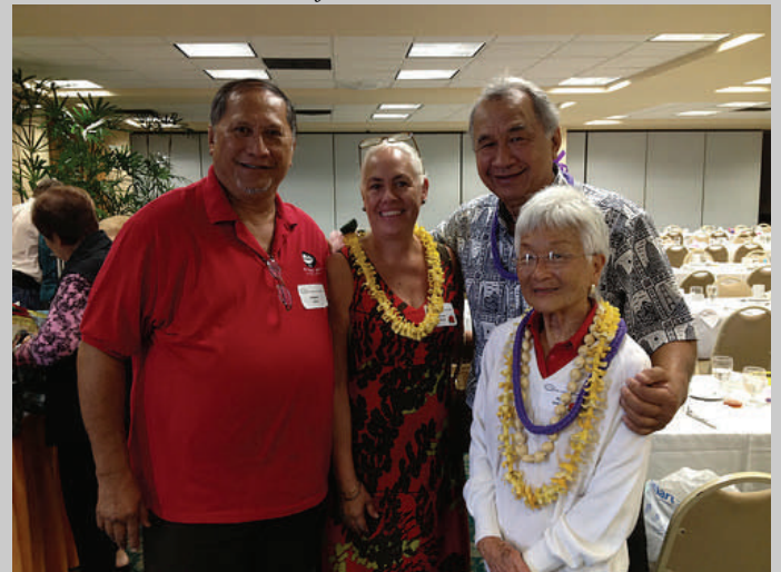
Senator Kahele at the HGEA Retiree's Luncheon