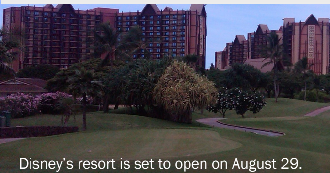
Disney's resort is set to open on August 29.