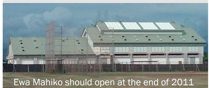
Ewa Mahiko should open at the end of 2011