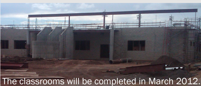
The classrooms will be completed in March 2012.