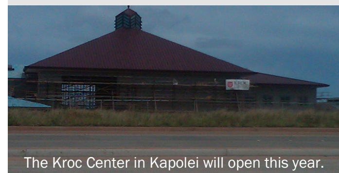
The Kroc Center in Kapolei will open this year.