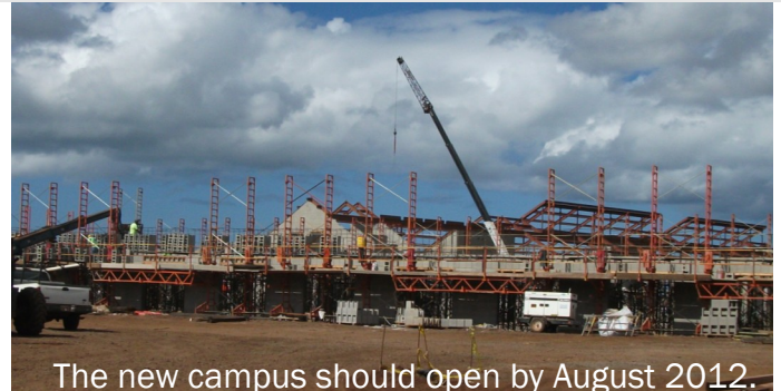
The new campus should open by August 2012.