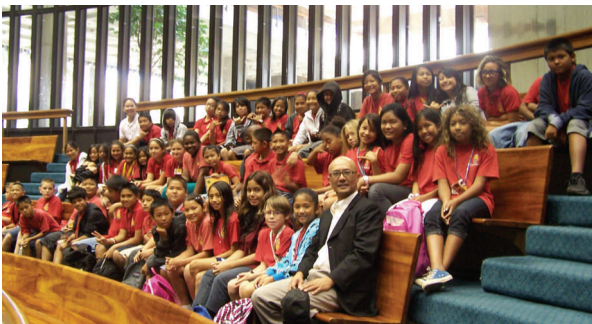
< Keoneula 5th graders visited the Capitol.