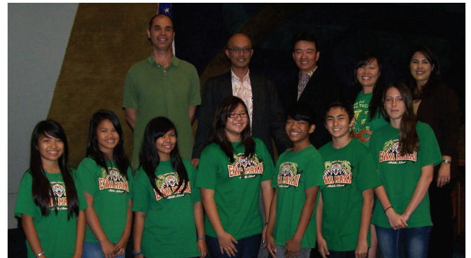
Ewa Makai students testified on their Green Schools resolution. >