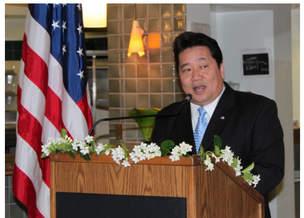
Speaking at the 63rd Annual Eagle Scout Recognition Dinner.