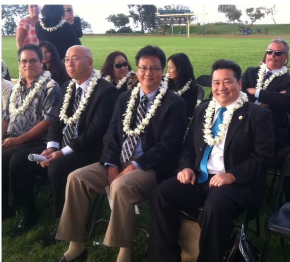
At King Kekaulike High School graduation.