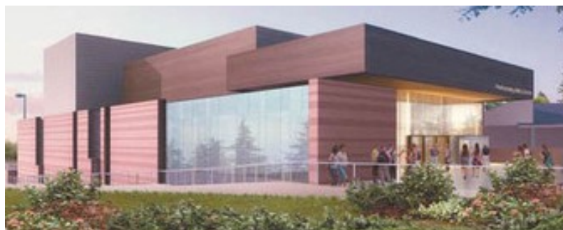
Artist rendering of the King Kekaulike High School Auditorium.