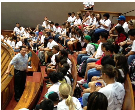
Pukalani Elementary School students visit the Hawaii State Capitol.