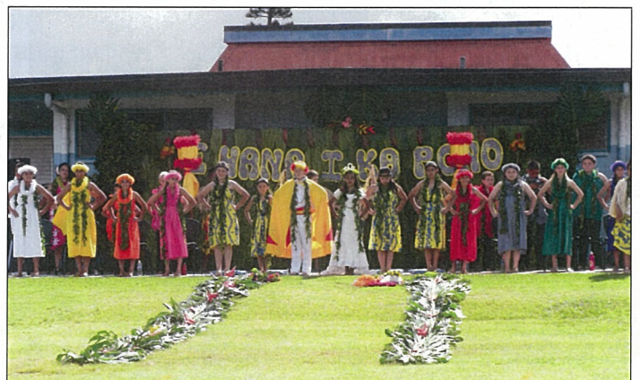
May Day at Makawao Elementary.

HB2487 & SB1269 Anti-Spiking; Public Employees. HB2487 includes a provision requiring a public employer to make an increased contribution to the retirement system for the excessive overtime of a public employee. This provision is intended to serve as an incentive for the public employer to control overtime. SB1269 provides that the retirement benefit and contribution of a new public employee (hired after June 30, 2012) shall be computed on base wages, which does not include overtime pay. Because these bills restrict the opportunity for a substantial increase of retirement benefits of a public employee near the end of the employee's career, these bills are commonly referred to as the "anti-spiking" bills.