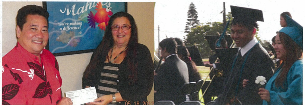
Left: Presenting a check to the Maui Food Bank. Right: Congratulations King Kekaulike 2012!

The Department of Land and Natural Resources was allocated a lump sum amount of over three million dollars to the Division of Forestry and Wildlife for various repairs and improvements. Projects include reconstruction of roadways in the Kula Forest Reserve that were damaged by flash floods. This "shovel ready" project is available for bids and to proceed into construction which will also help to stimulate the economy.