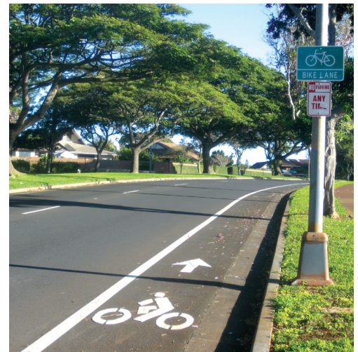
Mililani's new Bikeways, which I advocated for while serving on the OMPO committee.

I am very happy to inform you that the Meheula Parkway Bikeways have been created throughout Mililani. My office received calls from residents pleased with the bikeways to use with their families to bike through the town safely.