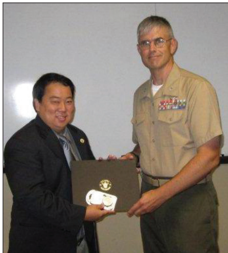
Attending the US Army War College National Security seminar.