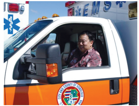
The Waipi'o Gentry-Mililani EMS Ambulance I advocated for will be extended to serve our community for 24 hours and 7 days a week.

Four years ago, in 2007 we were successful in securing one City and County EMS Ambulance servicing the Central Oahu community including: Waipi'o Gentry, Crestview, Seaview, Mililani, Mililani Mauka, and Waikele. I was very pleased to see the ambulance stationed in our community. The addition of this ambulance decreased the emergency response time to our Central Oahu communities, saving lives.