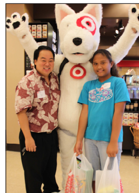
Participating in the Hawaii Salvation Army KROC Center's and Target Back to School Shopping Spree.