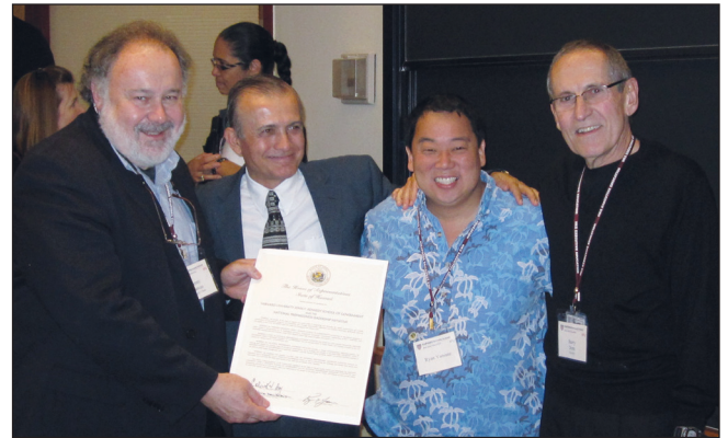
Recognizing Harvard University's administration for their community collaboration through the National Preparedness Leadership Initiative.

direction. I worked with many military officers in the War College's educational program and expressed the need for cultural sensitivity to our state; while focusing on the strategic role our state plays in national security; and honoring our servicemen, servicewomen, and their families.