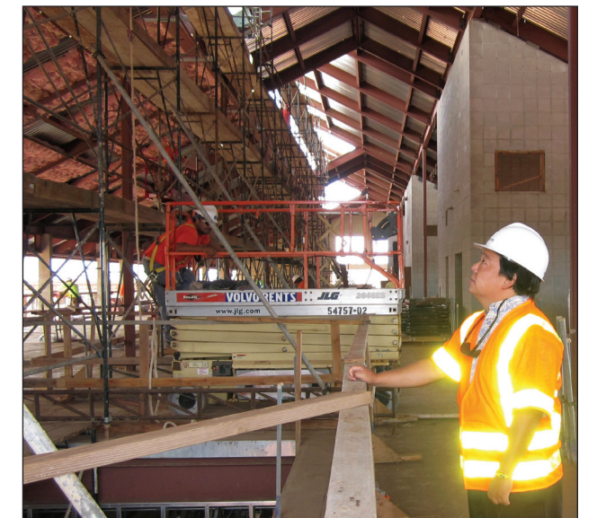
Examining the construction of the new University of Hawaii-West Oahu campus for our future students. This new campus is expected to open for classes beginning in the fall 2012 semester.