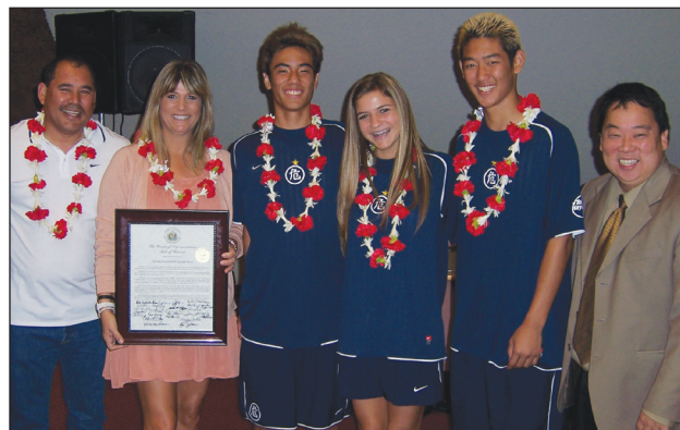
Recognizing Central Oahu's Abunai Soccer Team for their achievement in the House Chamber.

to meet national certification standards in energy and environmental design and U.S. Green Building Council standards. For more information on the development of UH-West Oahu, please visit: http://www.uhwo.hawaii.edu/newcampus/