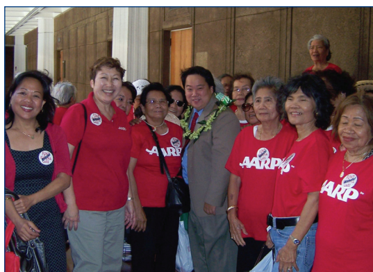
Rallying with Kupuna at the Capitol for funding for senior programs.