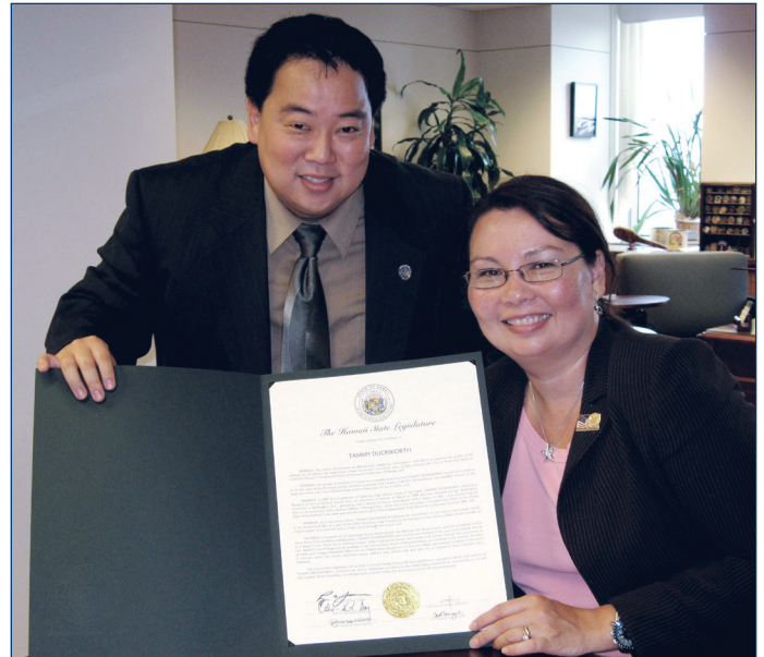
Presenting Under Secretary Tammy Duckworth with a Certificate from the Hawaii State Legislature for her dedication and service to our country and state.

I plan to continue to work with and support veteran agencies and groups, war veterans, and Active Duty families in our community.