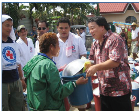
Providing aid and disaster relief to a flooded Filipino village after 4 typhoons hit the Philippines in the fall of 2009.

Act 99-Strengthening Graffiti Laws. Requires a person convicted of criminal property damage by graffiti to remove the