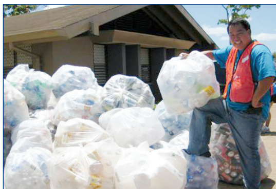
Co-Sponsoring Kanoelani Elementary School's community recycling project.