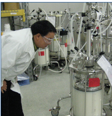
Visiting a vaccine laboratory and investigating the development of public vaccines.

The veteran’s license plate is a public declaration of service associated with the honor of serving one’s state and country. Acts such as murder, sabotage, rape, and/or espionage resulting in a dishonorable discharge should not be associated with the noteworthy veteran’s license plate. People discharged dishonorably should not hold the pride in owning this honorary license plate.