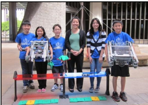
Moanalua Middle School's Robotics Team visits the Hawaii State Capitol on March 18, 2013 to demonstrate their robots.

Governor Neil Abercrombie announced the release of over $26.2 for capital improvement projects to improve Hawaii public school facilities. Salt Lake Elementary School was allotted $1,000,000 for the design, construction and equipment for renovations to convert two large open classrooms into four separate classrooms. The renovations will also provide sound and light separation between individual classes to eliminate distractions and promote learning.