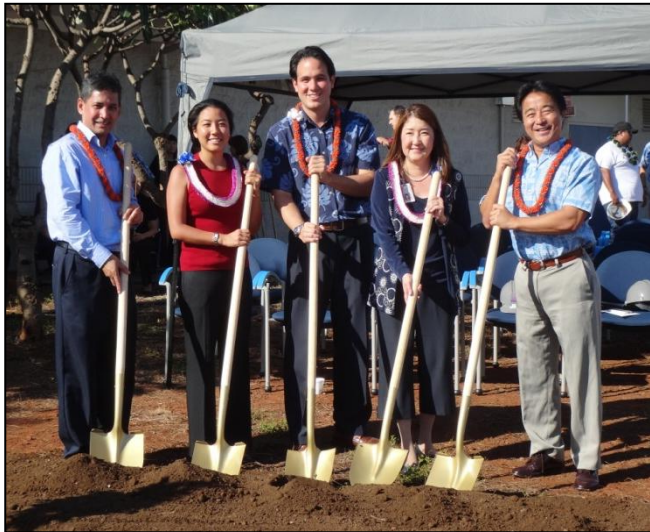
Dec 2, 2011- Ground Breaking Ceremony at Moanalua High School.

On December 2, 2011, a groundbreaking ceremony was held for Phase One of construction of the new Moanalua Performing Arts Center. Phase One is located near the Student Center and will include the new band room and practice facilities. The facility is being built with funds your area legislators worked to obtain for our community during the past legislative session, construction is expected to commence in mid December and will take approximately two years to complete. Please bear in mind that there may be some disruptions during the construction work, however every effort will be made to expedite the work with the least amount of inconvenience to our community.