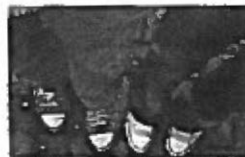
11 Ways to Make Friends as an Adult Tend