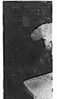
( http://photos.syracuse.com/2014/01/day_of_service )

The Rescue Mission was not rated by CharityWatch, which focuses on national