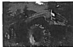
Four-Wheel Drive: What to Use and When Allstate Blog