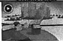
Milk Refrigeration Systems for India's Off-Grid Communities Wired Magazine