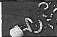
How Dangerous is a Broken Fluorescent Bulb? AARP