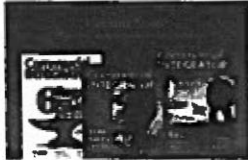
Goodbye, Incandescent Light Bulbs Commercial Integrator