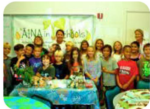
Students enjoy a chef visit to their classroom and learn to prepare a healthy, locally sourced snack during Farm to School Month in October 2013.