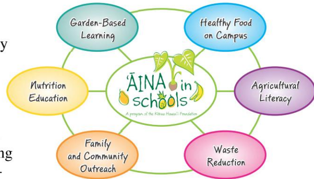
Six integrated components comprise the 'ĀINA In Schools program, a farm to school program of the Kōkua Hawai'i Foundation active since 2006.

Launched in 2006, 'ĀINA In Schools is a farm to school program of the Kōkua Hawai'i Foundation that is currently active in 15 public and charter elementary schools throughout O'ahu. During the Fall 2013 semester, 2,032 students took part in nutrition lessons, while 3,688 participated in garden and compost lessons and garden clubs. Five schools hosted 'ĀINA Chef Visits where local chefs led cooking demonstrations with 385 students making healthy, kid-friendly recipes with local and school garden-sources ingredients. Over 600 parent and community volunteers supported the program by giving almost 5,000 hours. In Fall of 2013, we trained 25 teachers from 14 schools to use the 'ĀINA lessons with thousands of additional students.