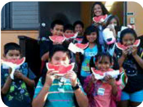
Elementary school students on O'ahu enjoy a fresh, locally grown fruit snack as part of their school's celebration of Farm to School Month in October 2013.

Thanks to Governor Abercrombie's designation of October 2013 as Farm to School and School Garden Month in Hawai'i, Kōkua Hawai'i Foundation encouraged and assisted schools in holding farm field trips, chef visits to classrooms, healthy snacks, and family nights focused on related farm to school themes.