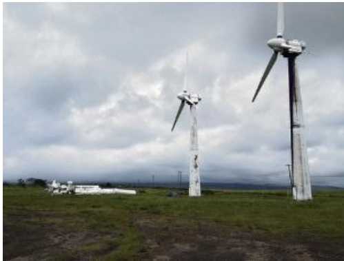
For six years 37 derelict turbines were left on site on the Big Island.

Any developer of industrial-scale wind power plants should be required to remove all material and restore the land to its former or better condition when a facility is abandoned or has reached the end of its useful life.