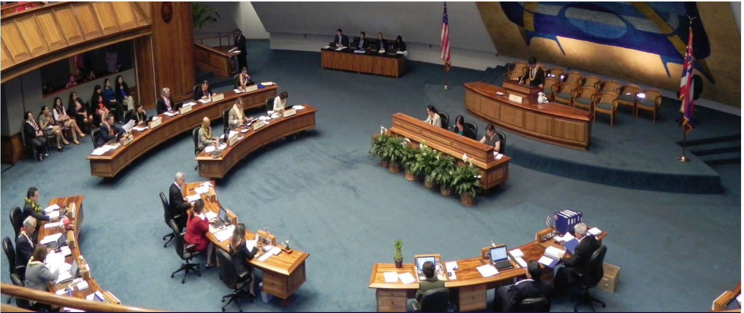
Photo taken from the gallery of the Hawaii State Senate Chambers on May 3, 2012, Sine Die.

The Senate also continues its strong support for education. Notably, the Senate has underscored education as a top priority. Through the State Budget, key areas of investment were made in the student weighted formula, student meals, Community Schools for Adults and student transportation.