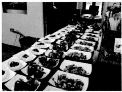
Various goodies from "In the Red" fund raiser.

Prior to the shot clinic, we sponsored a snack and dessert food sale featuring chocolate covered strawberries, Red Velvet Cupcakes, strawberry ice cake – things to remind us that while we were still "In the Red," we could still be generous to those less fortunate.