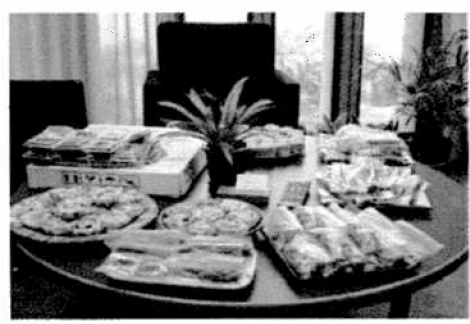
Various goodies from "Going Green" fund raiser.

To celebrate Saint Patrick's Day, we had a "Going Green" event and remind us all that we in the Senate are spearheading efforts to reduce our waste. We sold green goodies and salads for green cash or the equivalent in recyclable cans and plastic bottles (i.e., 20 cans = $1). This was followed by a "Spring Is Here" event which featured an "egg hunt" in which numbers qualified for various prizes and a sale of various desserts.