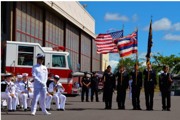
James Campbell High School Navy JROTC Color Guard during the 9/11 Remembrance Ceremony Centennial of Naval Aviation Open House