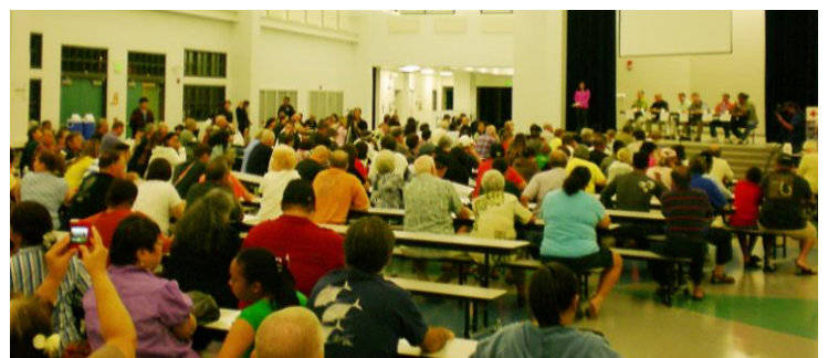
It was great to see so many residents at the Town Hall meeting!