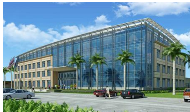
Illustration of planned FBI site in Kapolei

The FBI is currently located in one federal building and one leased facility in Honolulu, which are incapable of supporting new functions and staff. The 150,000 square-foot site will also host an indoor gun range.