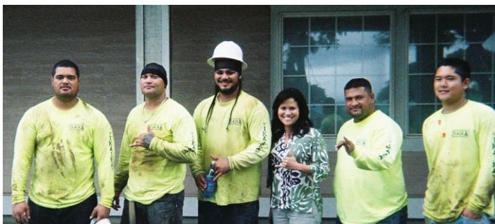
On the scene with workers ensuring progress in restoring electricity after the mass power outage