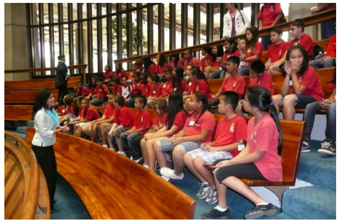
Students from Keone'ula Elementary tour the Capitol and learn about state government