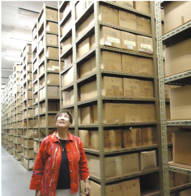
Representatives visited vast warehouses that store departmental files.