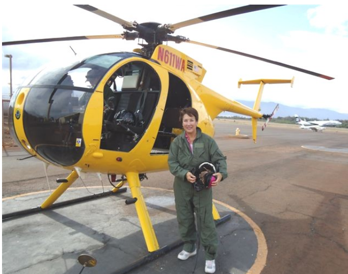
Finance Committee members observed an eradication program from helicopters above Hana, Maui.