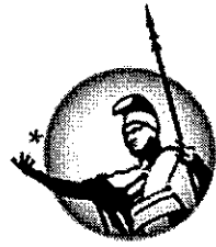
HAWAI'I AEROSPACE ADVISORY COMMITTEE