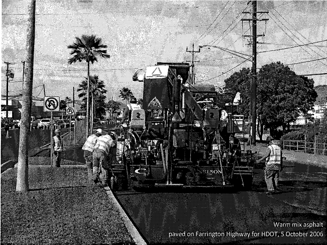
Warm mix asphalt paved on Farrington Highway for HDOT, 5 October 2006

An Exploration into the Use of Reclaimed Asphalt Pavement (RAP), Warm Mix Asphalt (WMA) and other Sustainable Strategies for O'ahu's Hot Mix Asphalt (HMA) Pavements