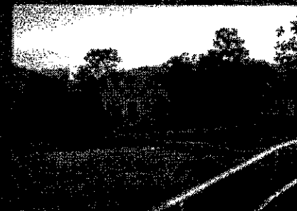
Top: Aerial view of the tree on a hillside and below the tree. Bottom: The area after the tree's destruction.

second summer session and the start of fall student orientations. In this way, the Campus Center Board and UHM administration avoided media attention and intervention by the thousands of people who had tried to save the tree.