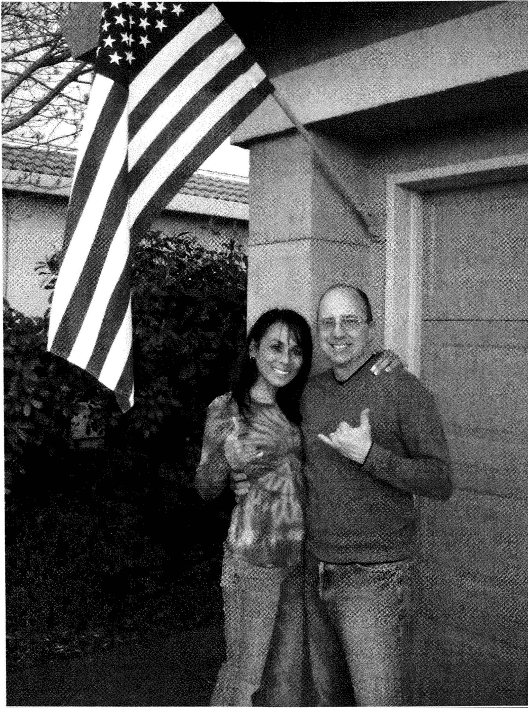
TYPE OF FLAG AND FLAG POLE WE REQUESTED TO POST AT OUR HOME OF RESIDENCY.