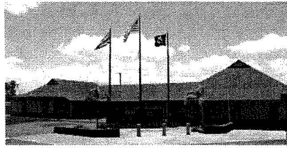
"a gathering place for veterans" OAHU VETERANS CENTER

5th Regimental Combat Team - 45th Infantry Division Association. Air Force Assn. - Chapter 138 Air Force Sergeants Association American Legion Aux. - Dept. of HI American Legion - Dept. of HI American Legion - Post 32 American Veterans Empowerment & Support - Community Operations BPOE VAWS - Hawaii Dist. China-Burma-India Veterans Association. Chosin Few - Aloha Chapter Combat Infantrymen's Association. Combat Veterans Motorcycle Club Disabled American Veterans - Chapter 3 Fleet Reserve Association - Branch and Unit 46 Hawaii Multiple Schools Unit - Jr. ROTC Korean War Veterans Assn - Chapter 1 Military Officers Assn. of America - Aloha Chapter Military Officers Assn. of America - Hawaii State Chapter Military Order of the Purple Heart Military Order of World Wars National Association. for Atomic Veterans National Association. of Uniformed Services National Sojourners - Hawaiian # 9 National Sojourners - Honolulu # 11 National Sojourners - Kamehameha #439 Pearl Harbor Survivors Association Radiated Veterans Samoan Providers Society of Military Widows - Aloha Chapter Sons & Daughters of Pearl Harbor Survivors Special Forces Association. - Chapter VIII State Office of Veterans Services Veterans of Foreign Wars - Dept. of Hawaii Veterans of Foreign Wars - Post 970 Vietnam Veterans of America - Chapter 858 Waves National - Unit 131 Women Veterans of America #26