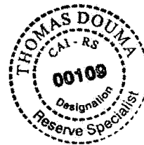
President Licensed General Contactor #26557