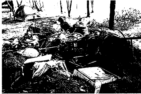
Waimanalo Beach Park, Mar. 2008.