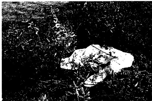
Ka Iwi coastline, August 2007.