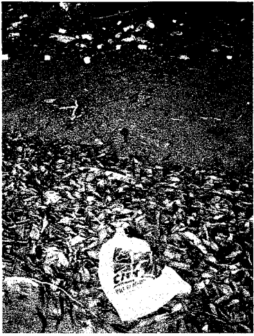
Ka Iwi, August 2007.