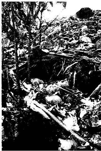
Makai Pier, Oct. 2007.