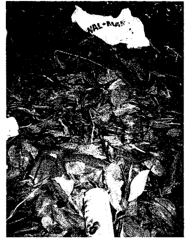
Ka Iwi, August 2007.