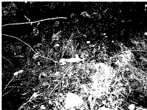
Portlock, July 2007.