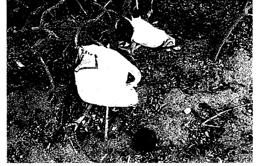
Kahuku Beach, February 2008.