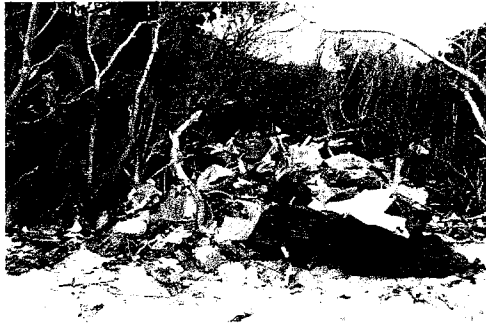
Shriners, March 2008.