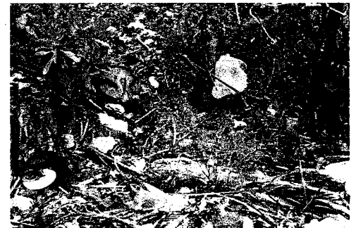
Makai Pier, October 2007.