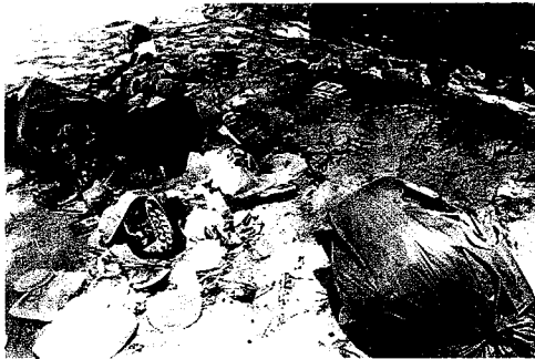
Sherwoods Beach, August 2007.