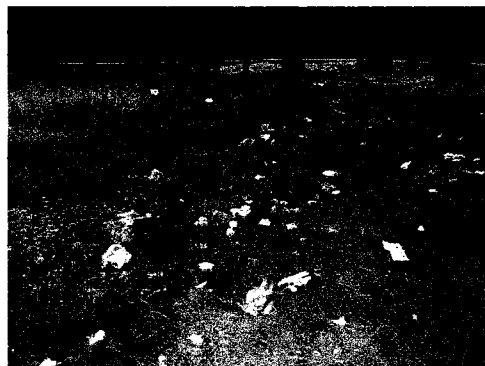
Bellows Beach Park, July 2006.