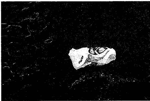
Ala Wai Small Boat Harbor, Aug. 08.