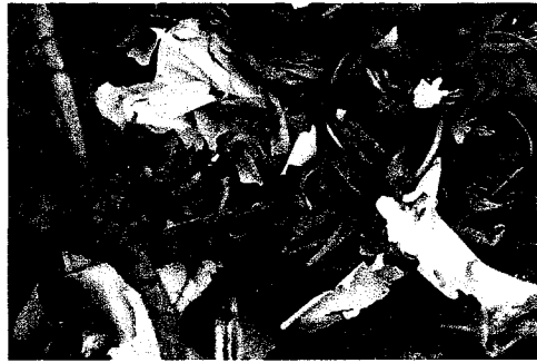
Kahuku Beach, December 2008.