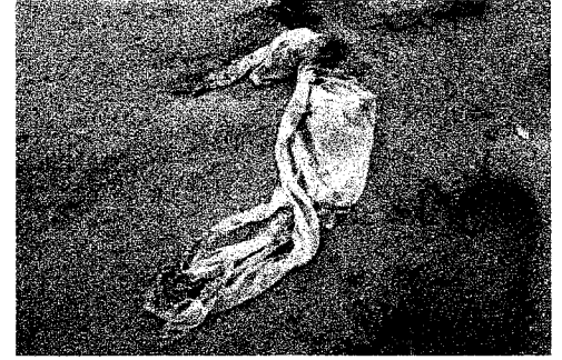
Sherwoods Beach, March 2008.