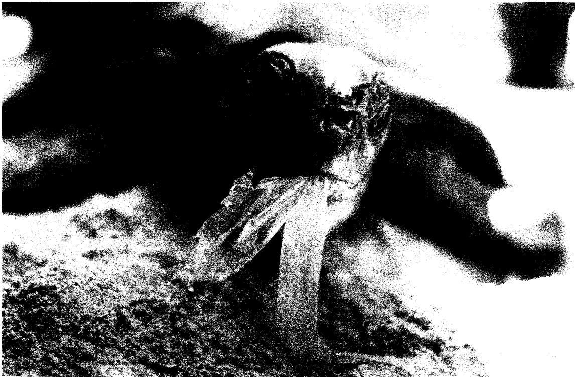
Green sea turtle eating plastic bag