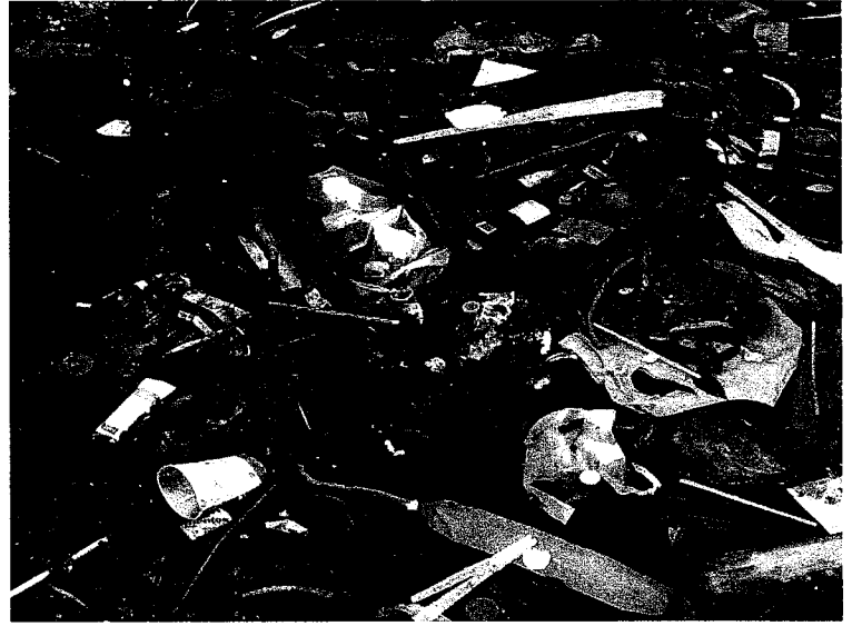
Ala Wai Small Boat Harbor, August 2008.