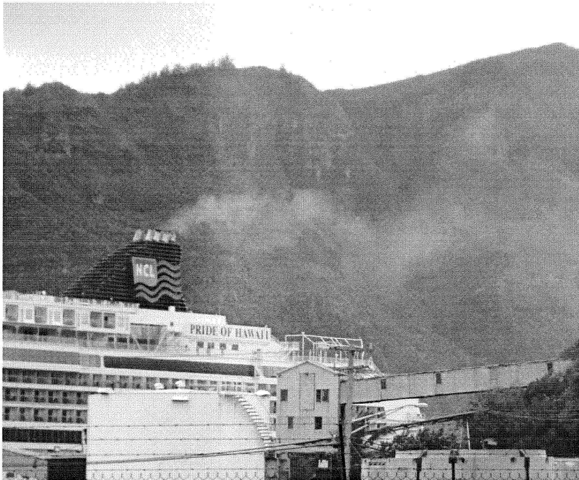
Figure 1. Picture of cruise ship at Nawiliwili harbor taken January 27, 2008 showing typical pollution spewing from smokestack and settling on Niumalu community.

and health of the community they are impacting. Their recent pulling of ships from Hawaii proves their lack of concern and I fully expect that they will pull operations completely within a year. But this bill is not directed at NCLA. It is directed at an industry. It must be passed to control air pollution in Niumalu no matter which shipping companies are using the harbor after NCLA leaves. The Department of Transportation is not protecting the community by expanding use of the harbors by pollution spewing ships. They must look at the secondary impacts of harbor expansion and increased usage.