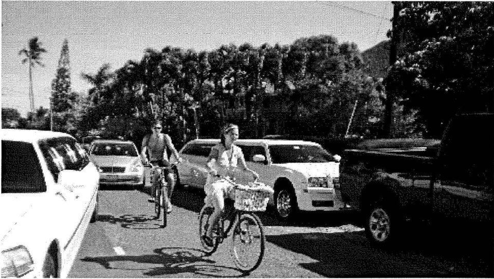
September 23, 2007: Bicyclists riding in path of traffic because of stretch limo parked in bike lane of Mokulua Drive