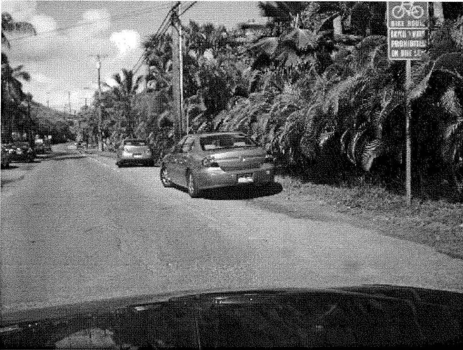
Two cars parked in bike lane of Mokulua Drive near entrance to Lanikai on November 29, 2007, shortly before noon.