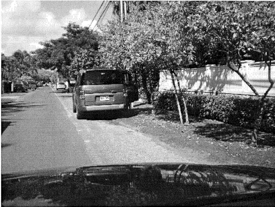
Mokulua Drive (November 19, 2007). Note second van in foreground.