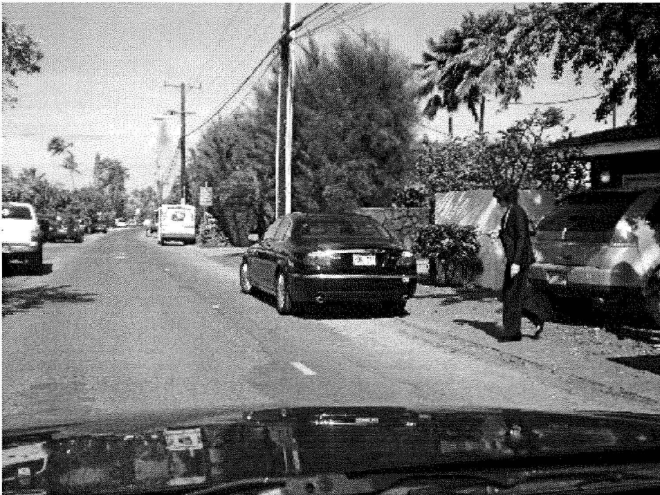
January 11th: Pedestrian car parked in bike lane at 1010 Mokulua near Kaiolena ROW (note: white markings are not the bike-lane demarcations; bike lane stripe is missing after BWS work)

Subject: SUPPORT HB 3249 (Thursday, February 21, 2008, at 2:45 p.m.)