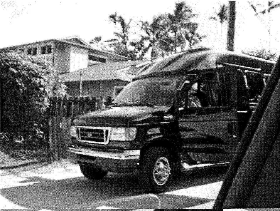
January 11, 2008 (view 2): Tour bus parked in Mokulua Drive bike lane at Kawailoa ROW (note: bike lane stripe not visible because of sand on street)