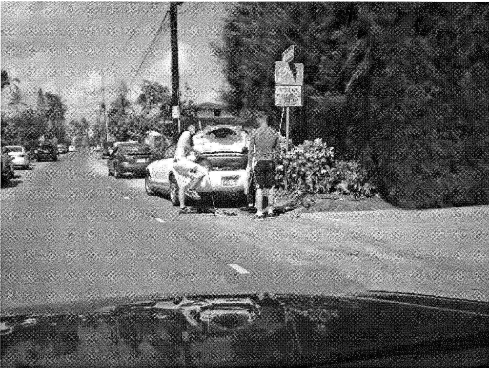
Two vehicles (and passengers) parked in Mokulua bike lane in 1000 block on November 25, 2007