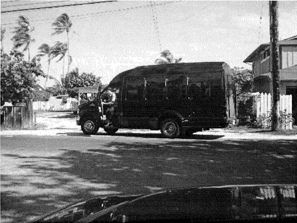
January 11, 2008: Tour bus parked in Mokulua Drive bike lane at Kawailoa ROW