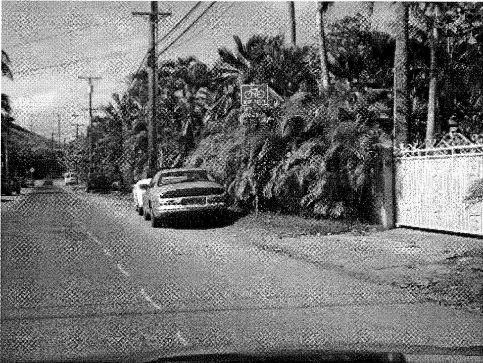
January 11, 2008: Two vehicles parked end-to-end in 800 block of Mokulua Drive (note: the bike lane stripe is barely visible further on ahead but absent in foreground; white marks are apparently left from BWS work)