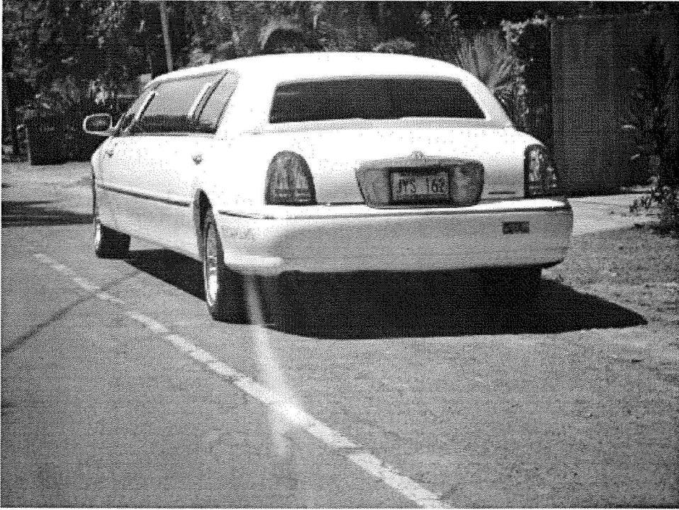
Aug. 13, 2007: stretch limo parked on bike lane of Mokulua Drive