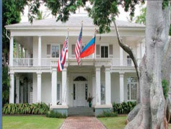
Executive Implements and enforces laws