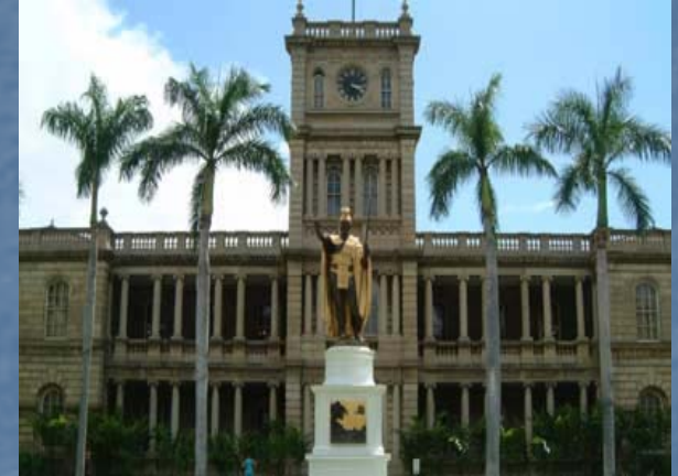
Judicial Interprets laws