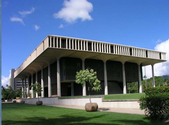
Legislative Makes laws