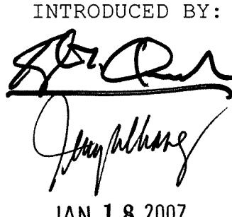
JAN 18 2007