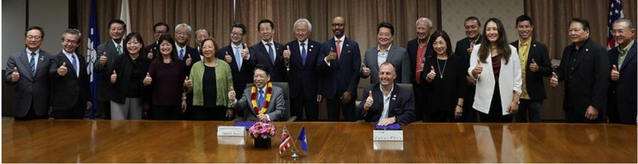
One Health MOU Signing, Governor's Office, Fukuoka Prefetural Government.

In December 2024, 15 students from Fukuoka Prefecture traveled to Hawai'i as part of the One Health program. Students were welcomed at Waipahu High School and observed and learned about the Health Academy at Waipahu. During their brief stay in Hawai'i, the Fukuoka students also met with education, government and health officials, too.