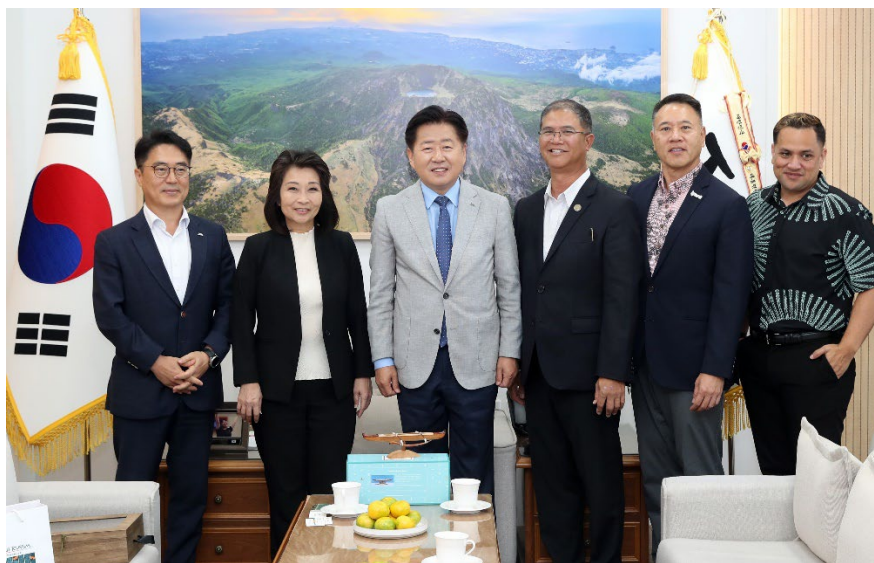
Members of the Hawai'i delegation meeting Jeju Provincial Governor Oh Young-hun.

In Jeju, Governor Oh Young-hun and Lieutenant Luke spoke about the challenges of climate change and renewable energy, recognizing that islands like ours must lead the way in sustainable development.