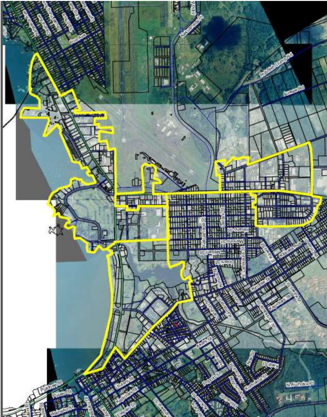
Hilo Community Economic District under Act 149, Session Laws of Hawaii 2018 (Area within yellow border)