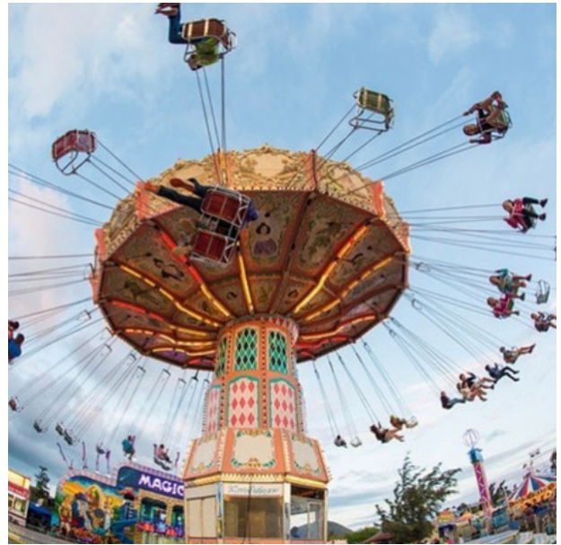
50th State Fair