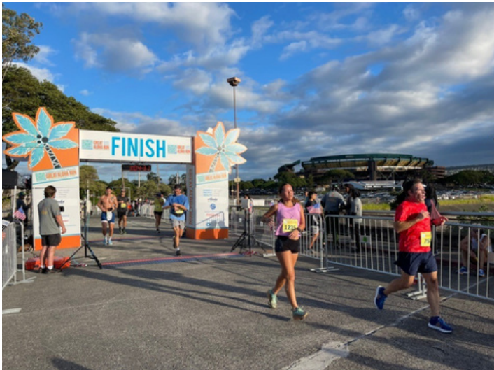
Great Aloha Run