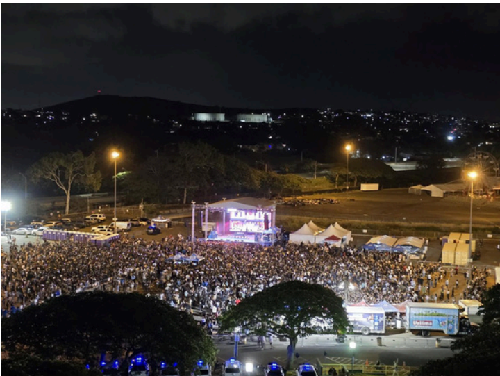
Concerts (Upper Halawa Lot)