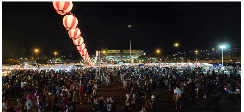
Megabon (Lower Halawa Lot)