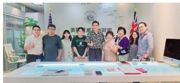
Professor, students, and parents from Chung Hua University visited the SHOT office