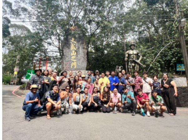
16 students from Kamehameha Schools visited Taiwan from July 14 to 26