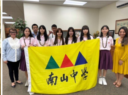
Nanshan High School visited Hawai'i on July 17, 2024