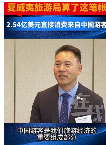
SHOB and HTC facilitated HTA's participation in the 14 th U.S.–China Tourism Leadership Summit