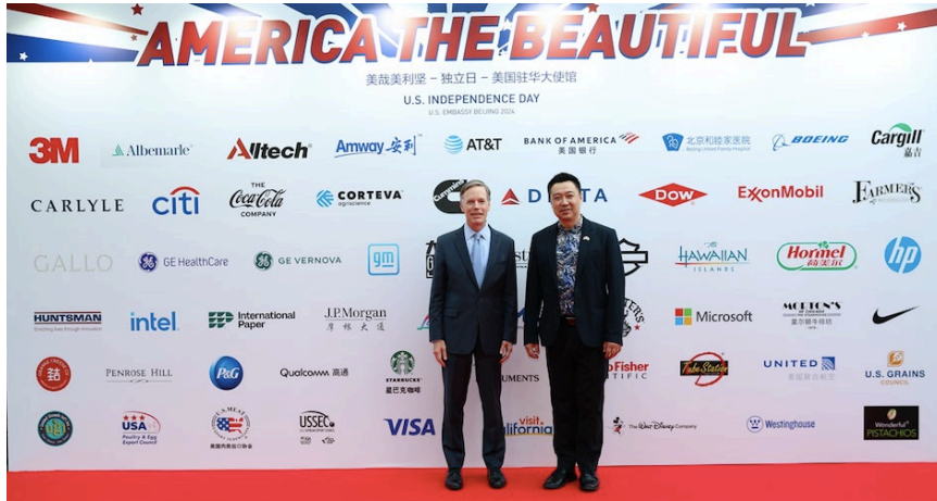
SHOB attended the Independence Day Sponsor Appreciation Reception at the U.S. Ambassador's Residence