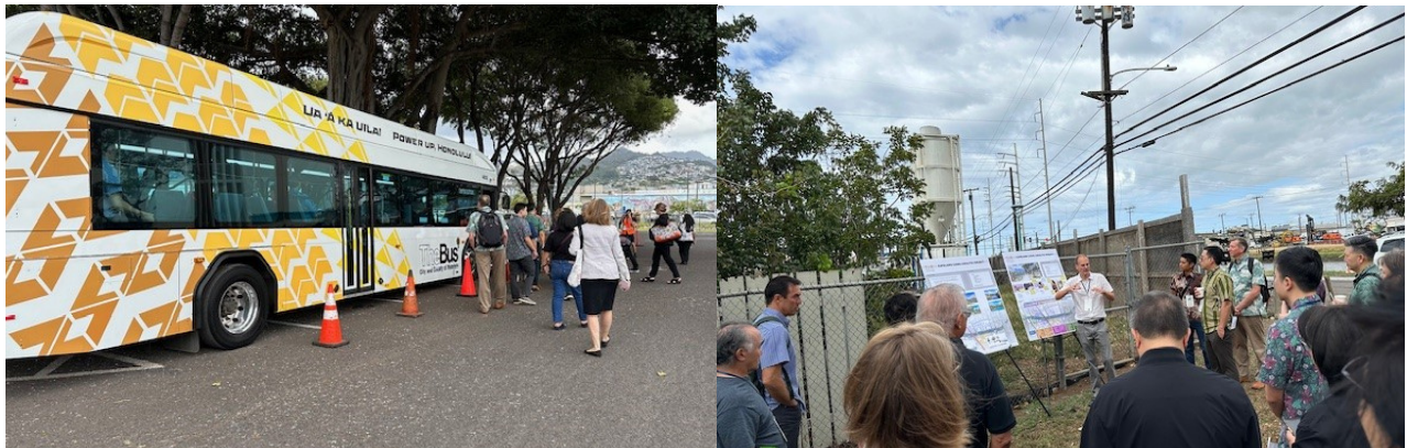
A bus tour took participants throughout the district. It stopped next to the Kapālama Canal to envision possibilities for the stream.

Kamehameha Schools plans to add approximately 5,000 units of mixed-use housing and build a creative hub called Kānaka. There was talk about turning Kapālama Canal into a potential recreational space.