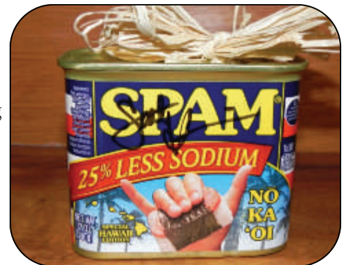
An iconic Hawaii food product, with Scott's label design that includes iconic Hawaii images – the Hawaii flag on the reverse, and an outstretched hand in full shaka position, clutching a perfectly molded SPAM musubi.

Canned spiced ham, more commonly known as SPAM, was widely distributed among military troops in the Pacific and in remote Hawaii during World War II, because fresh meat was in short supply and difficult to preserve. Quick-thinking Island entrepreneurs made sure it would be on Hawaii grocery shelves when troops returned from the battlefield. The popularity of SPAM soared in the 1980s when someone concocted the uniquely island "delicacy" – SPAM musubi – to the extent that Hawaii residents now consume more than 8-million cans of SPAM each year.