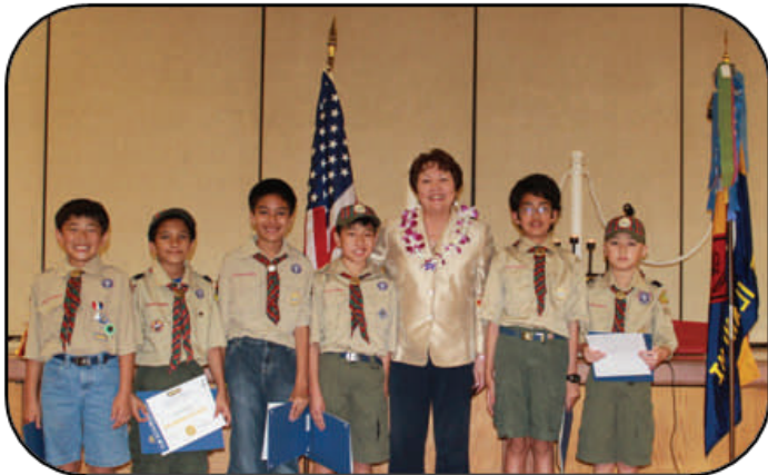
Friends and family honored recipients of Cub Scouting's highest Award – the Arrow of Light. Cub Scout Pack 564 celebrated the Pack's successful year at the annual Blue & Gold banquet.