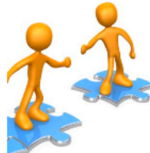
Collaborate with Stakeholders