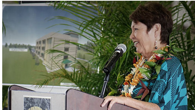
Photo Captions (L-R): Representatives and lawmakers breaking ground at Mililani Middle School during the ceremony; Senator Kidani addressing the crowd and sharing her excitement for the building to come.