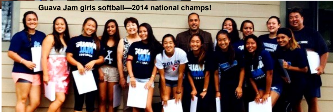
Guava Jam girls softball—2014 national champs!