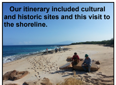
Our itinerary included cultural and historic sites and this visit to the shoreline.