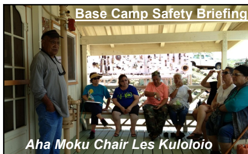
Base Camp Safety Briefing