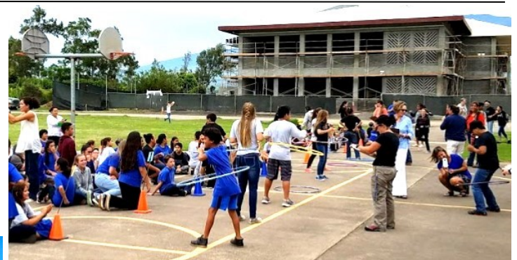
Waimea Middle School's still-under-construction $16 million, nine-classroom STEAM Building will be the largest structure in Waimea.

As Chair of the Senate Committee on Education I was invited to accompany Hawaii Island lawmakers on a tour of public schools in Kohala and Waimea. At right, the STEAM (Science, Technology, Engineering, Arts and Math) building at Waimea Middle School will open for the new school year. I worked with my colleagues in the 2013-2014 sessions to obtain $16 million in funding for this major new facility. The building includes a large interior corridor and three smaller rooms that can be used as alternative project work spaces for students. →