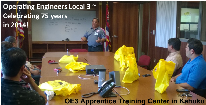
OE3 Apprentice Training Center in Kahuku

I was among legislators invited to a briefing at the Operating Engineers Local 3 Apprentice Training Center in Kahuku. The center is located in a remote area where trainees can practice using heavy equipment without disturbing neighbors. OE3 will accept applications for the next apprentice class for a few more days. The details and an application form are online at http://www.oe3.org/training/hawaii.html .