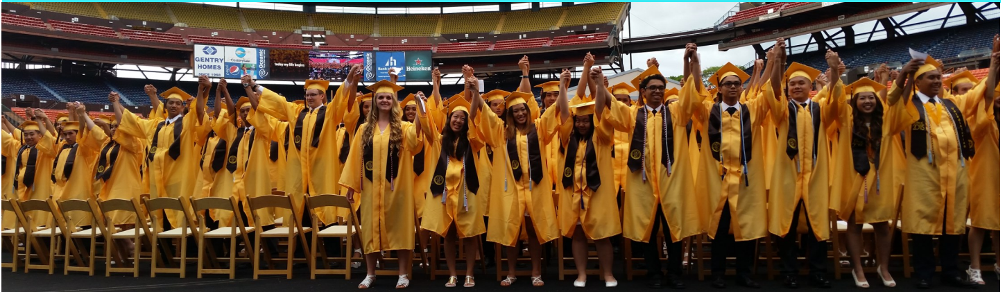
Mililani High School Class of 2015 ~ Aloha Stadium, Sunday May 24

Proud parents and other family members headed off to Aloha Stadium on Sunday to congratulate the equally proud senior Class of 2015 as their high school years officially came to an end. As noted elsewhere in the newsletter, the school has enjoyed an exceptional year both academically and in the successes of its athletic teams. Our Mililani community has embraced the school for its positive, nurturing environment that encourages creativity and values hard work that will serve its students well as they take next steps to fulfilling dreams. Congratulations and thanks to teachers and school leadership for a great year!